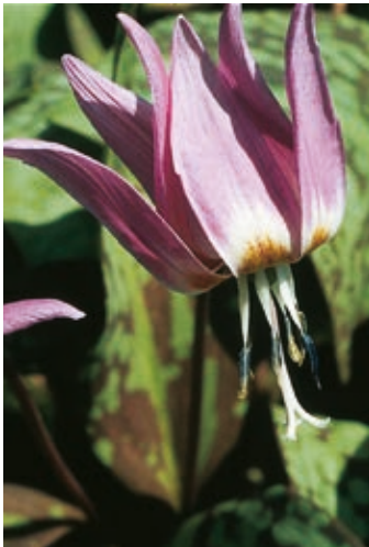
Erythronium dens canis