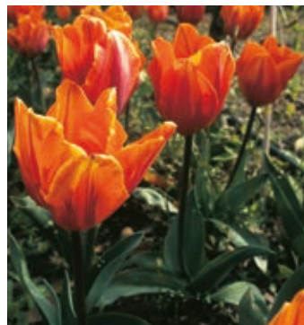
Tulipa Princess Irene