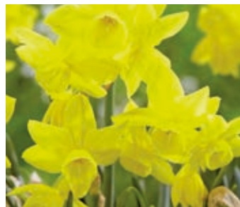
Narcissus Sunlight Sensation