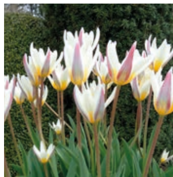
Tulipa Ice Stick

LITTLE BEAUTY BT1004 A very vigorous new hybrid with 3-4 intense pink flowers with a blue centre. Stunning. 4" April 10=£5.45; 30=£15.55