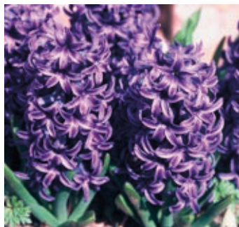
Hyacinth Blue Jacket