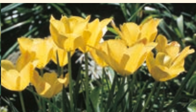
Tulipa bat. Bright Gem