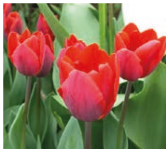
Tulipa Couleur Cardinal