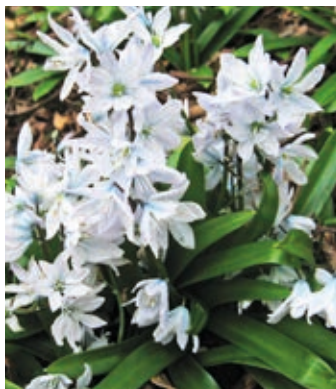
Scilla mischt 'Tubergeniana'