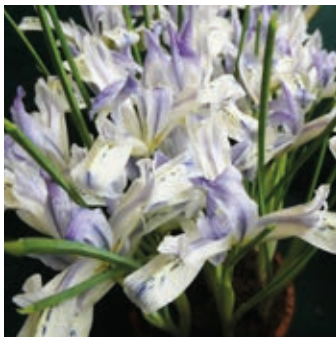
Iris Painted Lady