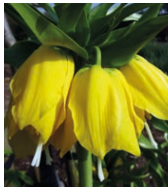
Fritillaria imperialis Lutea Maxima