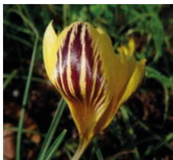
Crocus Gipsy Girl

MIXED BC2139 A well-balanced mixture of the Chrysanthus varieties, hand selected by us. 3" Feb-March 25=£11.30; 75=£32.20