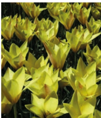
Tulipa clusiana Honky Tonk

clus. HONKY TONK BT1033 One of the fabulous new T.clusiana cultivars. Masses of lemon flowers with a faint purple blush on the exterior. Well deserving its AGM. 12" April 10=£5.95; 30=£17.00