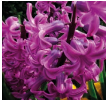
Hyacinth Miss Saigon