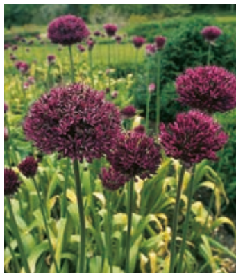
Allium Purple Sensation