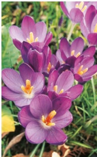
Crocus Ruby Giant

Everybody's favourite and one of the earliest. Soft lavender flowers with a silvery sheen. Ideal for naturalising.