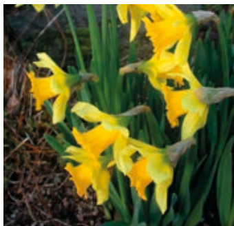
Narcissus R. Early Sensation

S STARLIGHT SENSATION (5) BN0342 Winner best US daffodil 2017. 3-5 stems per bulbs and 2-4 flowers per stem A lot of flower power! Creamy white with a light fragrance. 14" April 5=£6.60; 15=£18.80