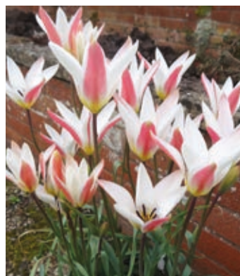
Tulipa clusiana stellata

LINIFOLIA BT1014 Vivid scarlet flowers on green stems with upright narrow grey-green leaves. Vigorous and long lived. 8" Late April 10=£4.70; 30=£13.40