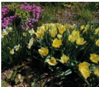
Tulip Bright Gem

ICE STICK (Kaufmaniana) BT1077 A very dramatic new hybrid. Although it is registered as a kaufmaniana hybrid it is much taller and very elegant. Fabulous in pots. Creamy white with a bronzed exterior. The dramatic seed heads are a bonus! Early. 15" March 10=£13.90; 30=£39.60