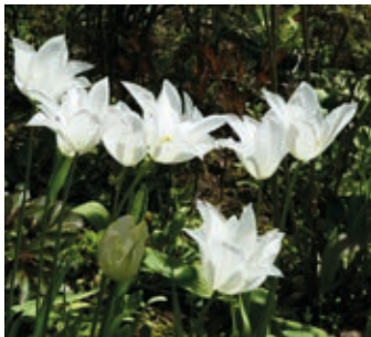
Tulipa White Triumphator

BT HOLLAND CHIC BT1769 A strongly waisted flower which opens white with a pink flush that gradually darkens and spreads. Distinct. 24" April 10=£9.10; 30=£26.00