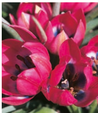
Tulipa Little Beauty