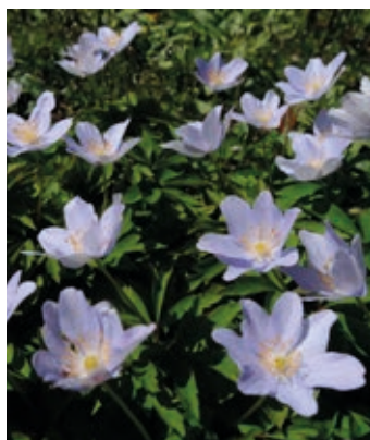
Anemone nemorosa Robinsonsiana