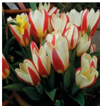
Tulipa The First