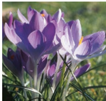
Crocus tommasinianus Whitewell Purple