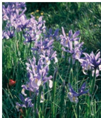
Iris Silvery Beauty