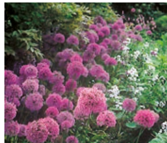
Allium hollandicum (aflatanense)