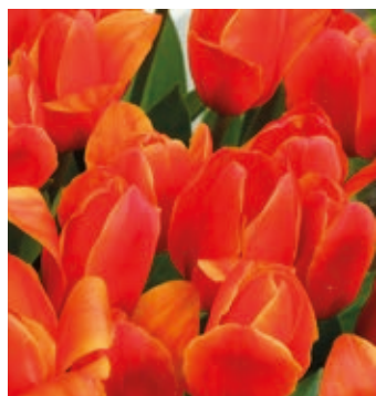
Tulipa Love Song