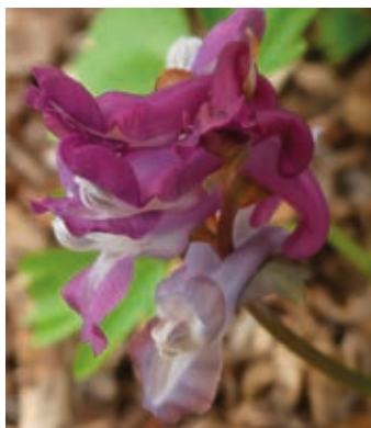
Corydalis Purple Bird