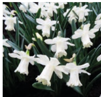
Narcissus Ice Baby