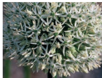
Allium Mount Everest