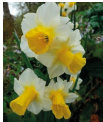
Narcissus Golden Echo

Order online at www.broadleighbulbs.co.uk