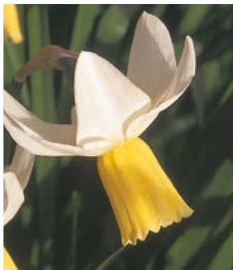
Narcissus Jack Snipe

★ New or re-introduction. S Scented N Suitable for naturalising.