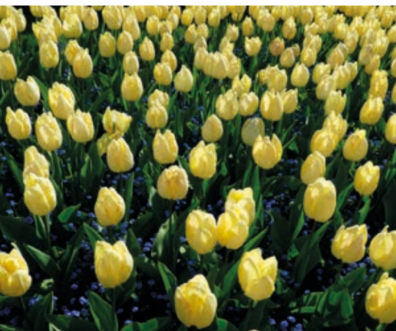
▲ Tulip Sunny Prince