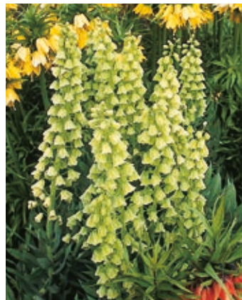
Fritillaria Ivory Bells & imperialis Lutea