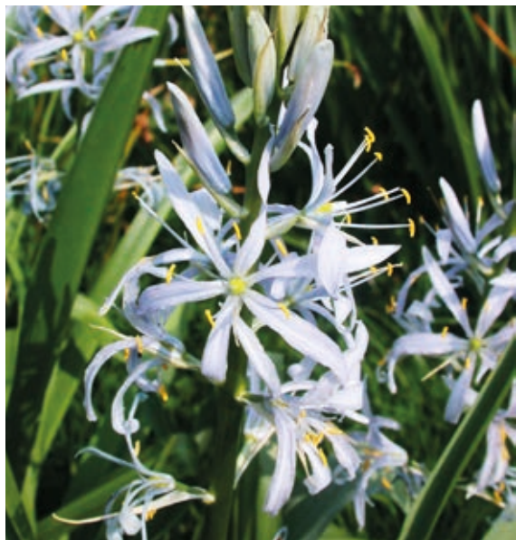
▼ Camassia cusickii