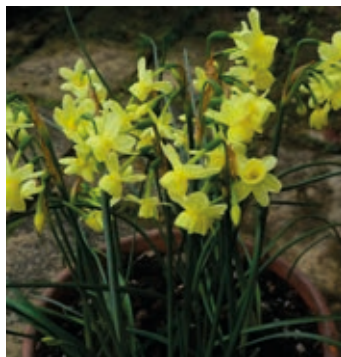
Narcissus Angels Breath

1 S GERANIUM (8) BN0513 A most striking poetaz with four to six flowers on an upright stem. Pure white petals with bright scarlet-orange cup. Good in pots. Strongly scented. 16" Late March 5=£8.30; 15=£23.65