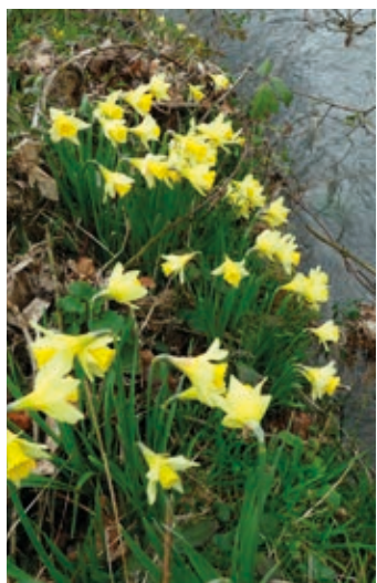
Narcissus Lent Lily by River Exe

A free-flowering, exquisite pale gold trumpet narcissus – a perfect miniature. Early.