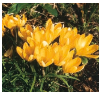
Crocus Large Yellow

PICKWICK BC2243 Large flowers the palest lilac covered in darker stripes. A good foil for the others. 5" March 10=£10.00; 30=£28.50