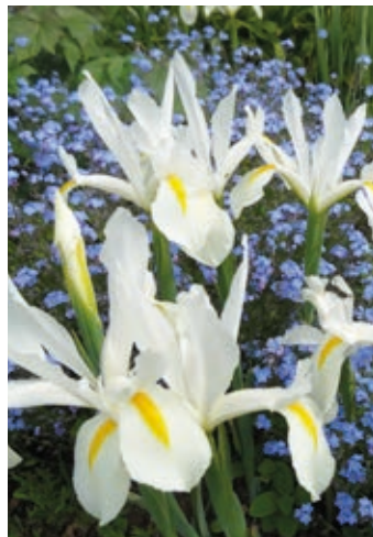
Iris White Excelsior