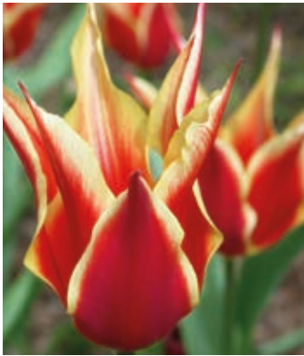
Tulipa Fly Away