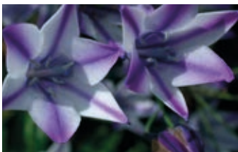
Triteleia laxa 'Rudy'