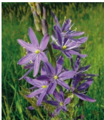
Camassia leichtlinii caerulea

CUSICKII BM5201 Large racemes of silvery-blue flowers. Ideal for adding colour to a sunny border. (Picture outside back cover) 36" May 3=£9.20; 9=£26.20