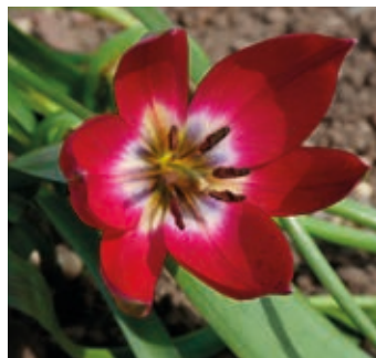
Tulipa Tiny Timo