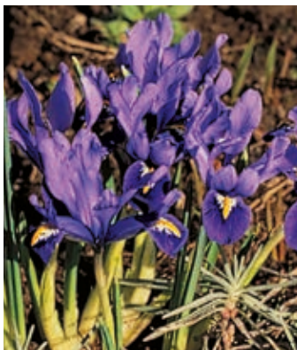
Iris reticulata Harmony