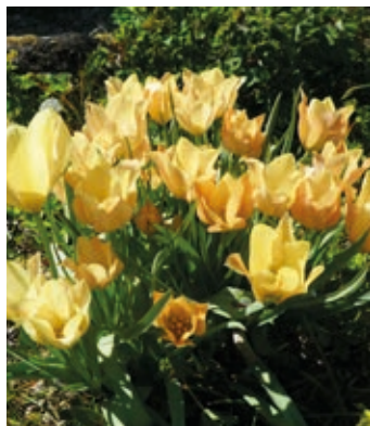
Tulipa bat. Apricot Jewel