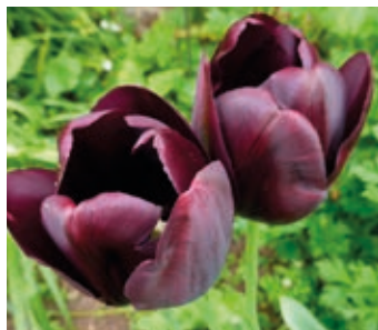
Tulipa Queen of Night