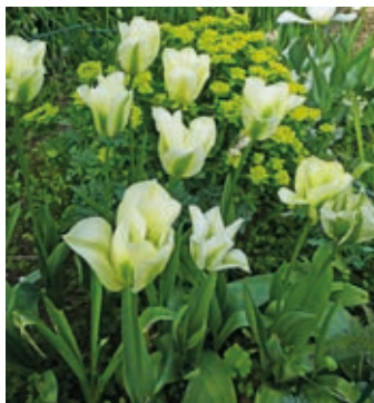
Tulipa Spring Green