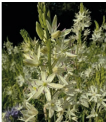
Camassia leichtlinii Alba