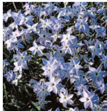
Ipheion Wisley Blue