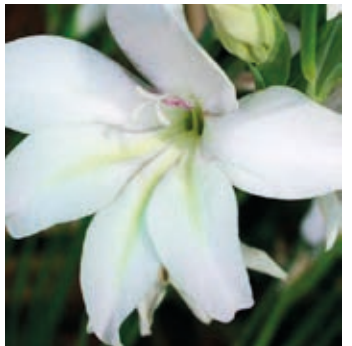
Gladiolus The Bride

COMMUNIS BM5495 This is the original species with slender spikes of delicate purple-pink flowers which is often mis-supplied for the much larger variety byzantinus. It increases rapidly and is much more suitable for naturalising as at Wisley where they follow on from camassias. 2" June 10 = £4.80; 30 = £13.70