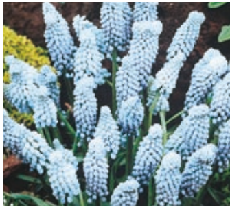
Muscari Valerie Finnis

Very striking. The top of the flower is pale blue while the bottom is very dark. One single leaf. 10" April