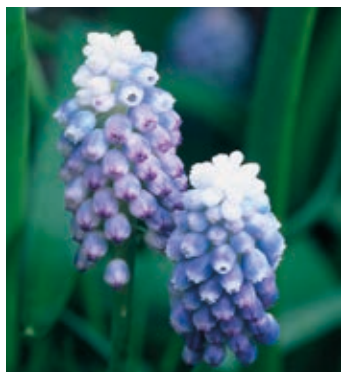
Muscari Ocean Magic