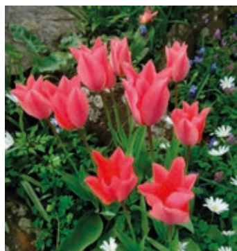
Tulipa Albert Heijn