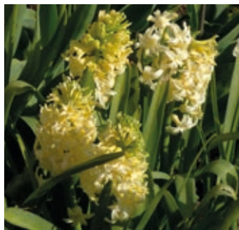
Hyacinth City of Haarlem