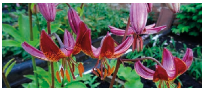
Lilium Claude Shride

One of the easiest and best known lilies. Glistening white flowers with purple backs. Heavily scented and lime tolerant. Good in pots or borders. 4' June-July 3=£11.20; 9=£31.90