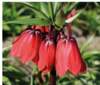
Fritillaria Red Beauty