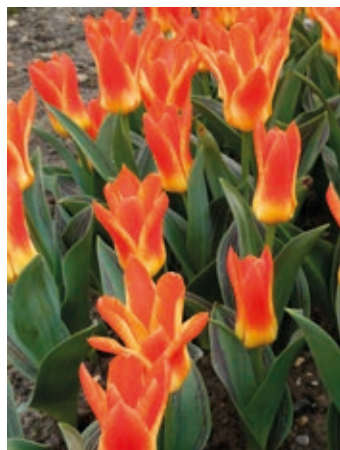
Tulipa Mariss Jansons