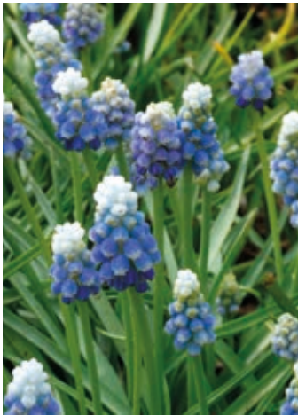
Muscari Mountain Lady

One of the best new grape hyacinths with large spikes of the palest blue flowers. Superb and not too vigorous! 6" March-April