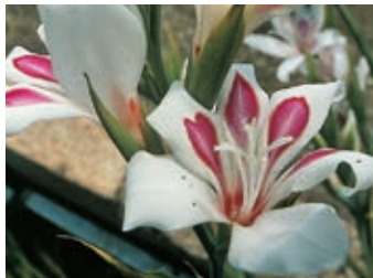
Gladiolus Prince Claus

These are not to be confused with the large-flowered Gladiolus. They flower much earlier, are smaller, more elegant and do not require staking. They are hardy in the south of England and like to be planted in full sun in a good garden soil. There are two planting times — autumn and spring. The varieties listed below should be planted as soon as they are received in Oct./Nov.