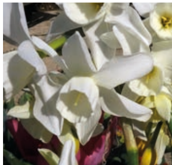
Narcissus Starlight Sensation

N THALIA (5) BN0337 A lovely old triandrus hybrid with one to three delicate nodding white flowers on each stem. Excellent for naturalising. Picture inside front cover. 12" Late March 5=£6.20; 15=£17.65