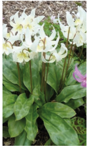
Erythronium White Beauty

🏆 TUOLUMNENSE BM5346 'PAGODA' A most beautiful and vigorous hybrid with large sulphur-yellow flowers. 10" April 3 = £6.20; 9 = £17.65