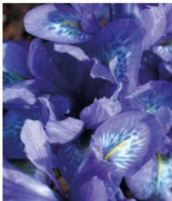
Iris Lady Beatrix Stanley