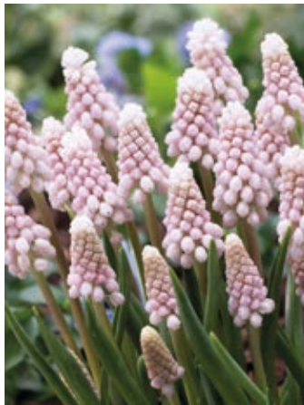
Muscari Pink Sunrise