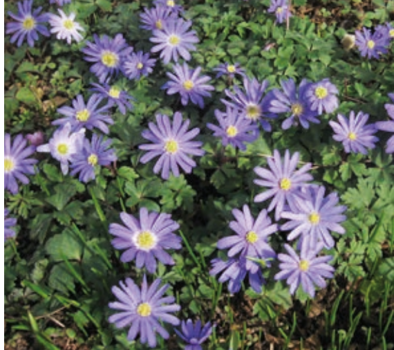
Anemone blanda blue ▲