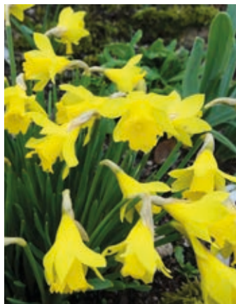
Narcissus Little Gem

Masses of pure white heavily scented flowers. Plant bulbs on the surface of the soil and keep the pot on a cool windowsill, not in the dark. Just keep the bulbs unplanted in a light place until you are ready to plant. Flowering is usually 6 weeks after planting.