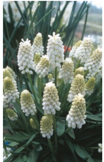
Muscari White Magic