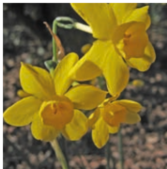
Narcissus jonquilla Twinkling Yellow