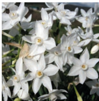
Narcissus Paper White