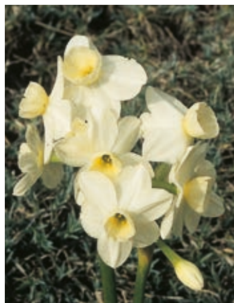
Narcissus Silver Chimes