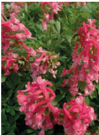
Corydalis Beth Evans

★ New or re-introduction. N Suitable for naturalising.