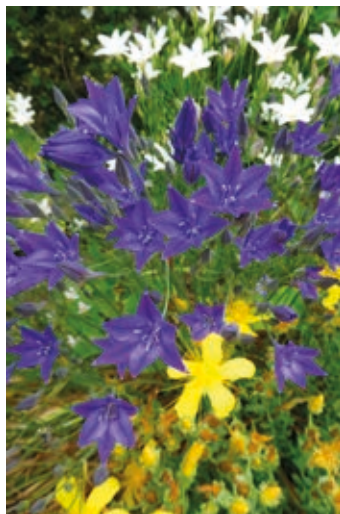
Triteleia Queen Fabiola & Silver Queen