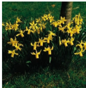
Narcissus Little Witch

Up to four perfect round yellow flowers with slightly deeper cups. A sure-fire winner and highly desirable. Excellent in pots or will naturalise.