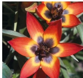
Tulipa Little Princess