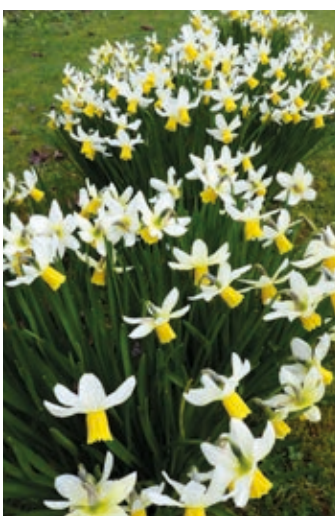
Narcissus Jack Snipe

TWINKLING YELLOW (13) A much improved selection of this well known species. Up to 6 strongly scented golden flowers per stem. Full sun. Picture page 20 12" April 5=£5.00; 15=£14.30