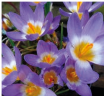
Crocus sieberi tricolour

★ New or re-introduction. N Suitable for naturalising.