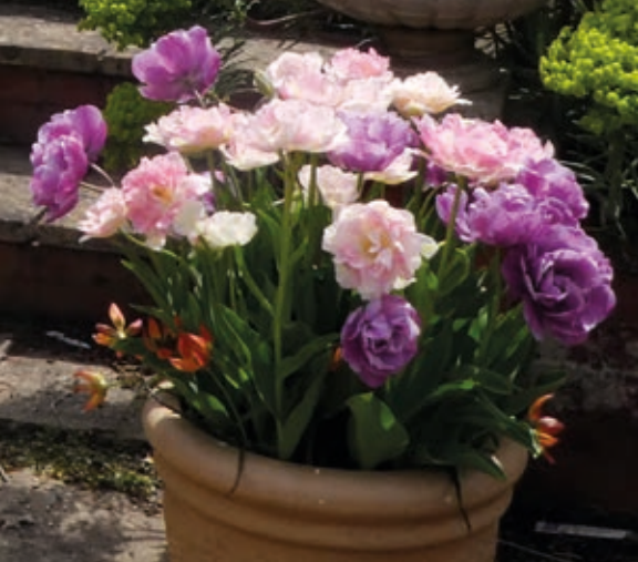
▲ Tulip Angelique & Blue Diamond