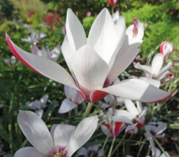
▲ Tulipa Peppermint Stick