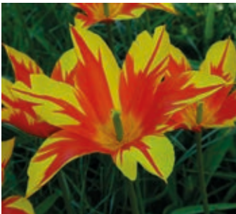
Tulipa Fire Wings

BT FLY AWAY BT1762 For something really different – dramatic red flowers edged with yellow. Very long lasting. 24" April-May 10=£6.55; 30=£18.65