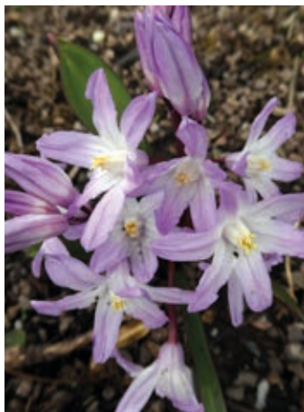
Chionodoxa Pink Giant