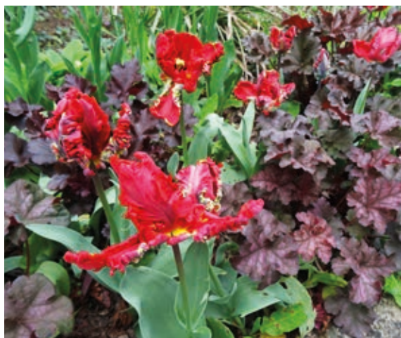
▲ Tulip Rococo