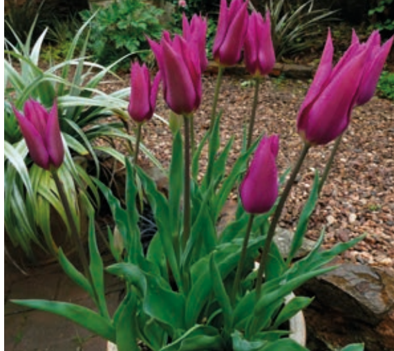
▲ Tulip Purple Dream