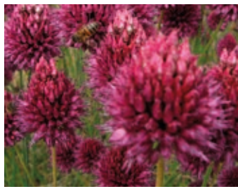
Allium sphaerocephalum & bee

★ New or re-introduction. N Suitable for naturalising.