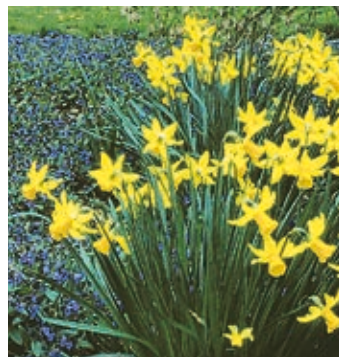
Narcissus February Gold