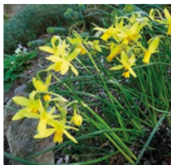
Narcissus Tiny Bubbles

A free flowering miniature variety with 2-3 flowers per stem and 2-3 stems per bulb. Bright gold throughout with swept back petals.