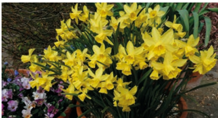
Narcissus Yellow Sailboat