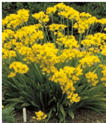
Allium moly 'Jeannine'