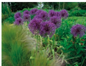
Allium Purple Rain