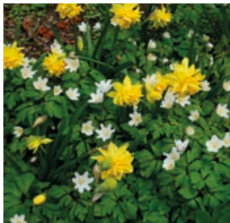
Narcissus Tete Boucle