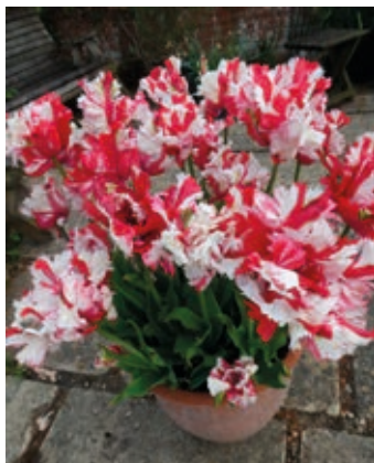
Tulipa Estelle Rijnveldt