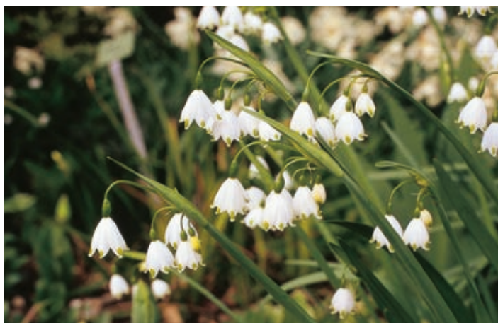
Leucojum 'Gravetye Giant'