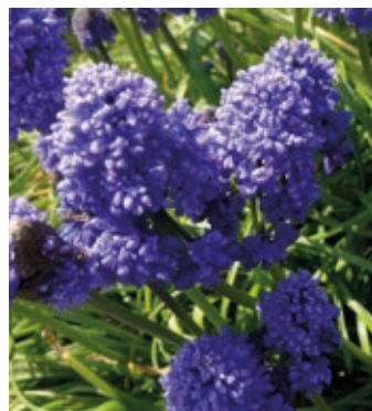
Muscari Blue Spike