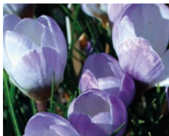
Crocus Blue Pearl

BLUE PEARL BC2123 Everybody's favourite. Soft delicate blue with bronze base and silvery-blue outside. 3" Feb-March 10=£5.80; 30=£16.55