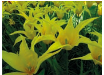
Tulipa La Perla

BT WHITE TRIUMPHATOR BT1756 Still the most popular variety with slender pure white flowers that seem to glow. 24" April-May 10=£11.60; 30=£33.05