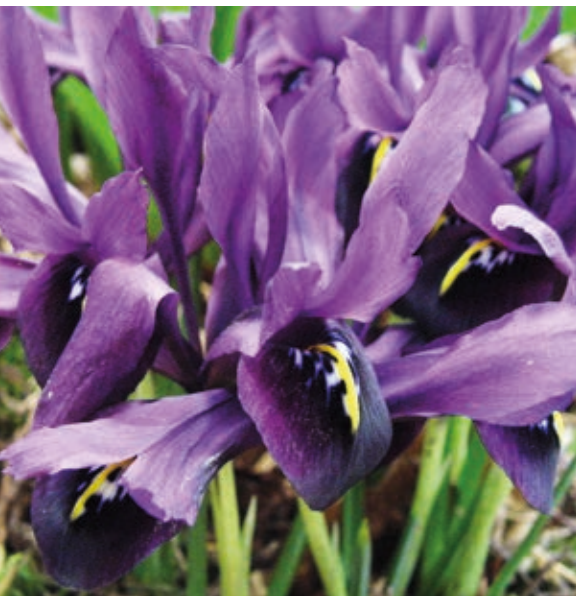
▼ Iris Purple Hill