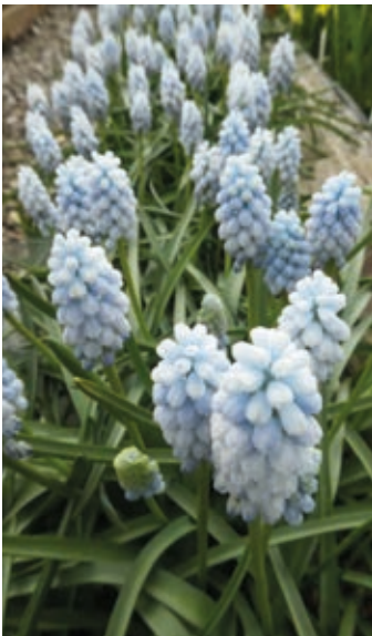
Muscari Baby's Breath