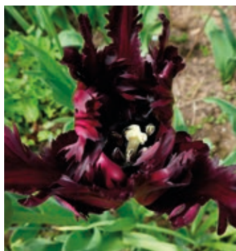
Tulipa Black Parrot