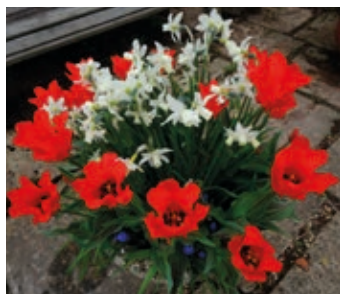
Tulipa Red Riding Hood